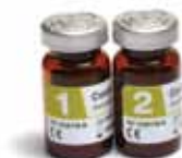
Daily Quality Control