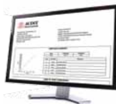
Data Reduction Software