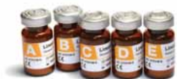
Calibration Verification/ Linearity